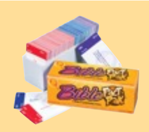
Bible Fact-Pak question cards serve as the foundation for the Bible Master test.

Award achievement by presenting the appropriate pin from My Healthy Church.